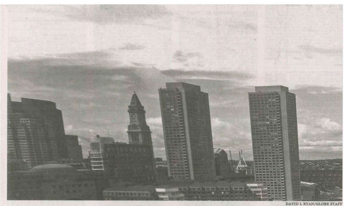
A view of the South Boston Waterfront outside the John Joseph Moakley United States Courthouse. New condo